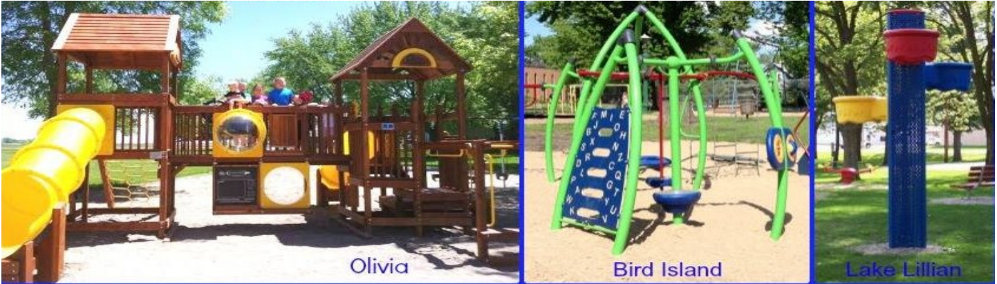
Sunrise Park on east boundary of Olivia—Bird Island Main Street Park between Elm & Dogwood—Lake Lillian Park 310 Lakeview St

A big thank you to all three communities for supporting early childhood!